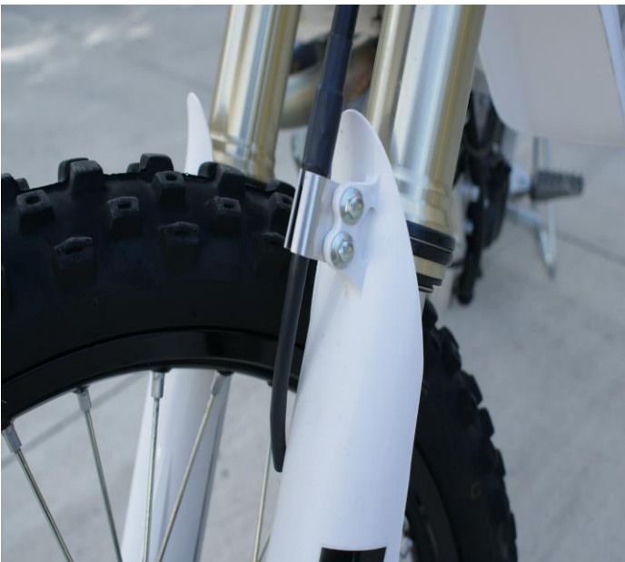
C. Stock Line Holder at Fork