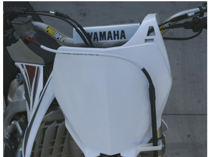
B. Number Plate/ Stock Line Holder