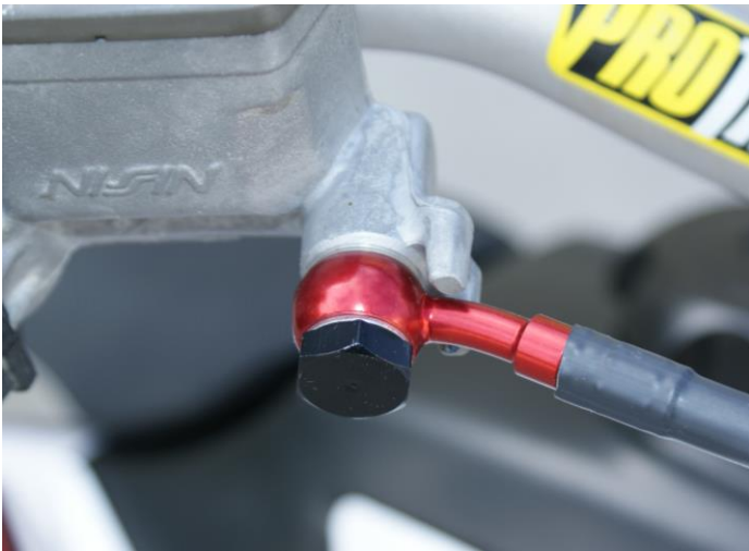
A. Master Cylinder

get used to the new brake lever pressure and feel. We recommend checking your brake system periodically; be sure to check that your bolts are tight and VERY carefully check your lines for any leaks or damage. If there are any signs of damage or stress to the lines, the complete brake line kit will need to be replaced. Remember, our brake lines have a LIFETIME WARRANTY! If you have any problems or questions, do not hesitate to call our tech department - (800) 685-6633.