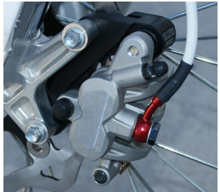
D. Caliper with optional Galfer Oversize relocation bracket