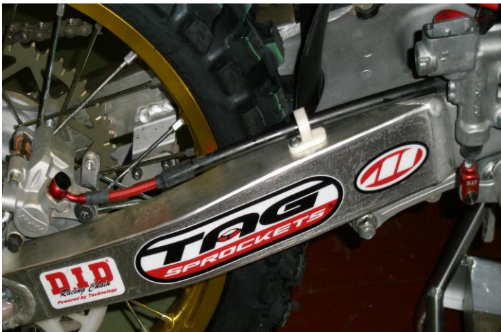
C. Line routed down the swing arm to caliper