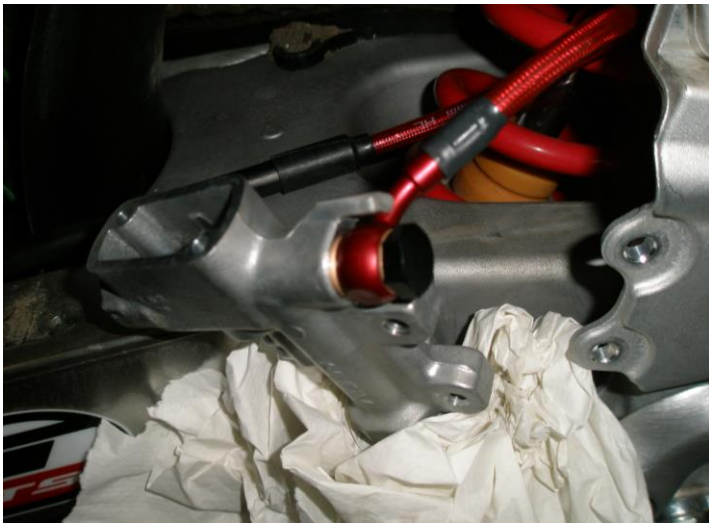
A. Rear Master Cylinder (removed from frame)

get used to the new brake lever pressure and feel. We recommend checking your brake system periodically; be sure to check that your bolts are tight and VERY carefully check your line for any leaks or damage. If there are any signs of damage or stress to the lines, the complete brake line kit will need to be replaced. Remember, our brake lines have a LIFETIME WARRANTY! If you have any problems or questions, do not hesitate to call our tech department - (800) 685-6633 .