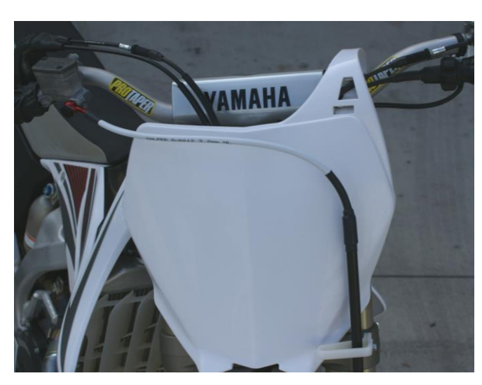
B. Number Plate/ Stock Line Holder