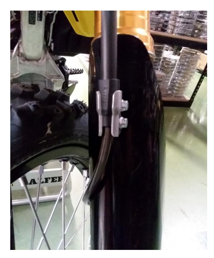
C. Stock Line Holder at Fork