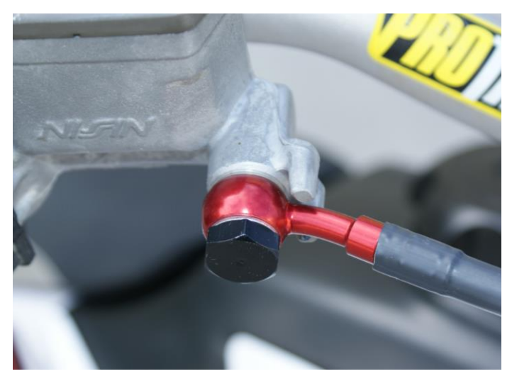
A. Master Cylinder

Please be aware that the overall braking feel has been changed dramatically. We suggest taking it easy while you get used to the new brake lever pressure and feel. We recommend checking your brake system periodically; be sure to check that your bolts are tight and VERY carefully check your lines for any leaks or damage. If there are any signs of damage or stress to the lines, the complete brake line kit will need to be replaced. Remember, our brake lines have a LIFETIME WARRANTY! If you have any problems or questions, do not hesitate to call our tech department - (800) 685-6633 .